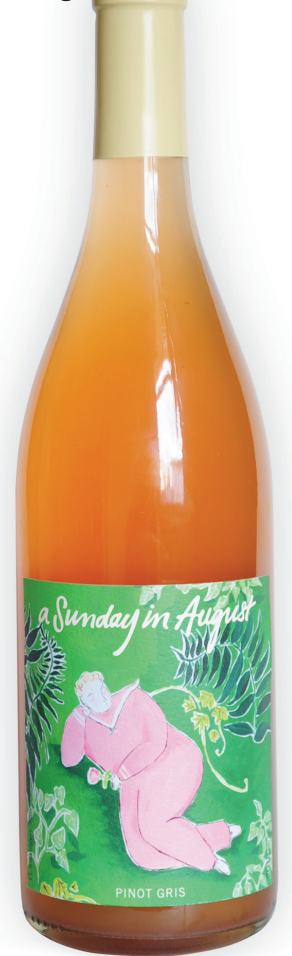
Label Art Claire Milbrath | clairemilbrath.com

SKU 132657 Release date: April 5, 2019 800 cases produced 11.5% alcohol 750ml bottle & 19.5L keg